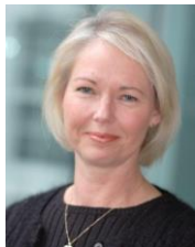
RCN Professional UK Lead - Criminal Justice Nursing/ Learning Disability Nursing Royal College of Nursing