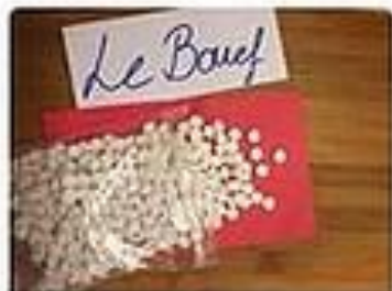
10 Pieces White Heart 130-150mg MDMA Content $4.49