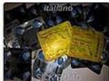
VEGA 100mg Sildenafil citrate 4 tablets $1.50