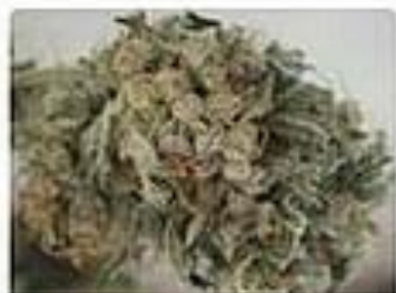
1/4 oz G13 $8.13