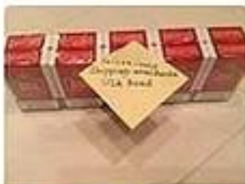
Red and White Filter (10 packs x 20 cigarettes) $1.90