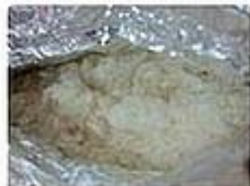
1 gram MDMA $5.89