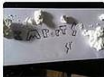
1/2g Cocaine $5.44