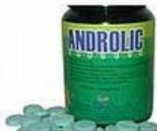
100 x Anadrol 50MG Oxymetholone (sealed ) $12.41