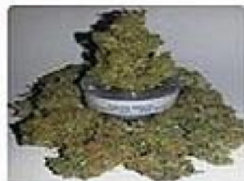
10 gram Santa Maria $11.58